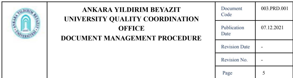
Table 1: Example Document Coding